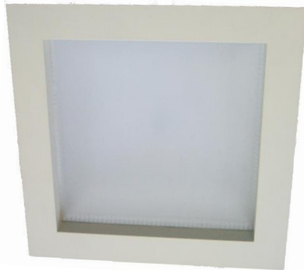
Cut-Out 200 x 200 mm